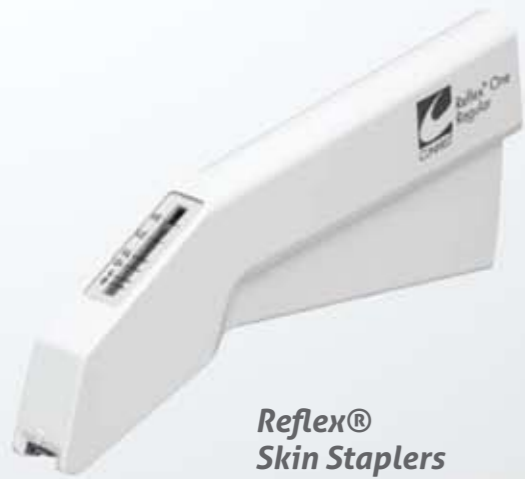
Reflex® Skin Staplers

GEM was formed in 1994 with the goal of marketing and producing innovative surgical adhesives in order to anticipate the requests of an ever more sophisticated market. Glubran® 2 is a synthetic biodegradable cyanoacrylic-based surgical glue that is ready for use in open and laparoscopic surgery, and may be used as an embolizing agent in radiology and vascular neuroradiology. Glubran® 2, with its high adhesive and haemostatic properties proved in over ten years of scientific studies, is versatile, efficient and reliable.